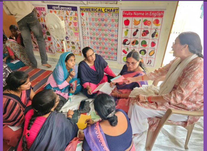
CPC Training: Group discussion in Risk Mapping