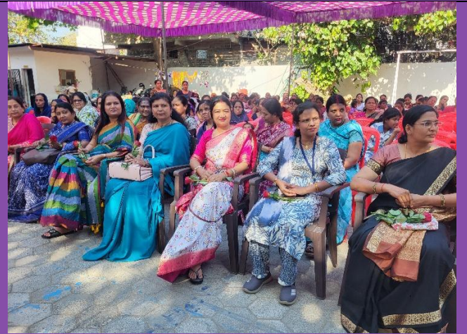
International Women's Day Celebrations