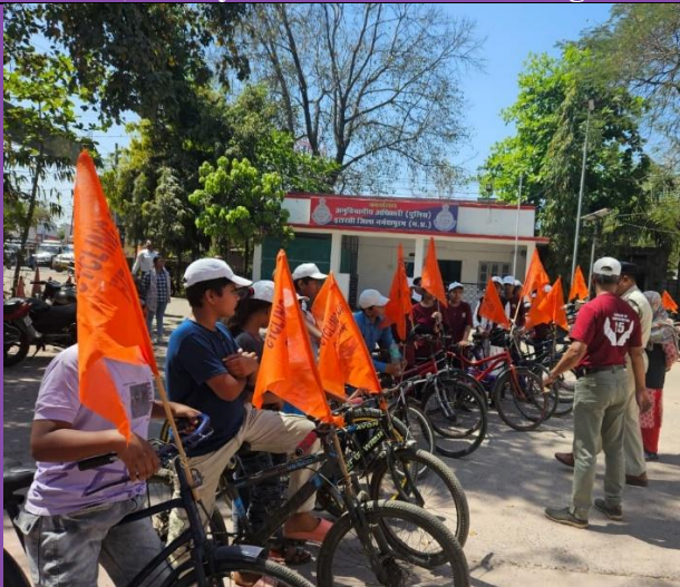
Cycling for Fit India