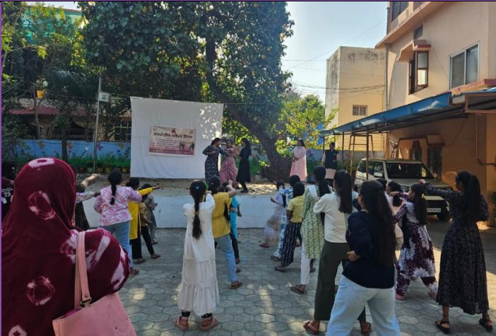
Self Defence, Safety & Protection Training

Cluster Level Child Protection Committee Traiing: 30th March 2026: Around 50 participants who are the members of Child Portection Committees in 6 wards of Itarsi Municipality participated in the training organised by Jeevodaya. The main focus was to understand the importnace of creating child safe and child friendly wards, identifying the risk factors and developing risk mitigation startegies at community level.